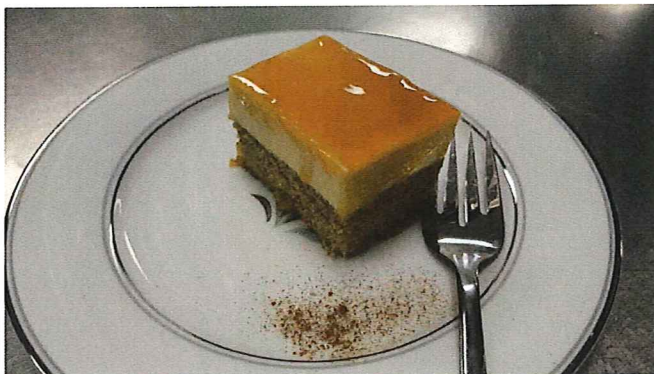
Shown here ready to eat!